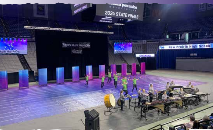
Well done Indoor Percussion Ensemble and Show Band!